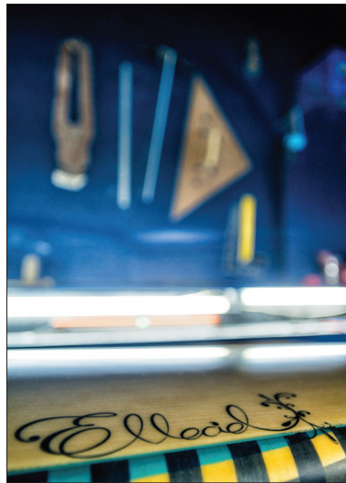
Sarong cloth is often used.