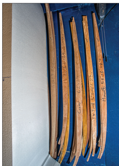
Handmade jigs for shaping.